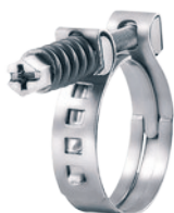
PG 178 for small diameters