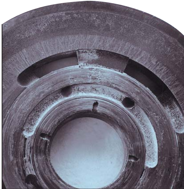
Typical results of wear due to presence of particulate and water contamination.

Condensation is also a prime water source. As fluid cools in a reservoir, temperature drop condenses water vapor on inside surfaces, which in turn causes rust. Rust scale in the reservoir eventually becomes particulate contamination in the system.