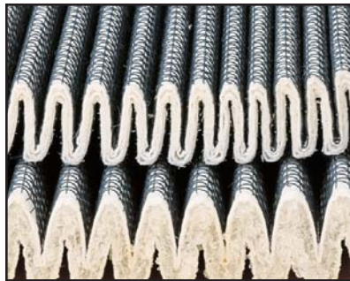
Photo above shows 'dry' Par-Gel filter media and the same media swollen with absorbed water.