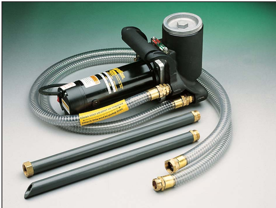
Guardian® Portable Filtration System