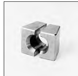
Fig. R71 — Flaring Die Set

Dimensions and pressures for reference only, subject to change.