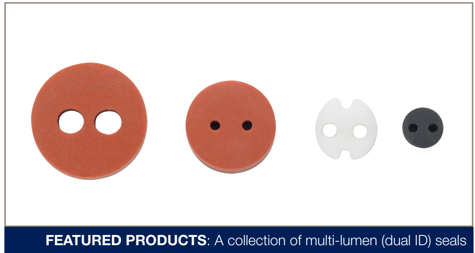
FEATURED PRODUCTS: A collection of multi-lumen (dual ID) seals

*The information below is intended for internal Parker and Parker distribution networks only, please DO NOT redistribute. Contact us for permission before publishing this information.