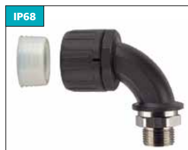
HGL-90M 90° Elbow Swivel External Thread with conduit seal