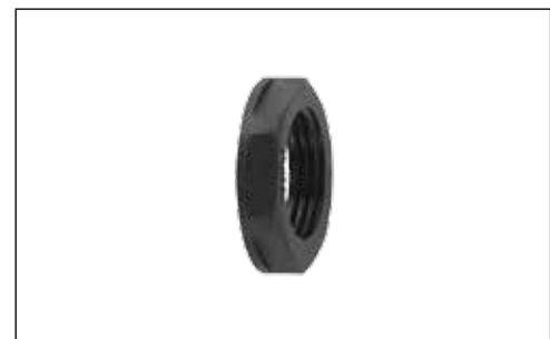
ALPA Nylon Locknut