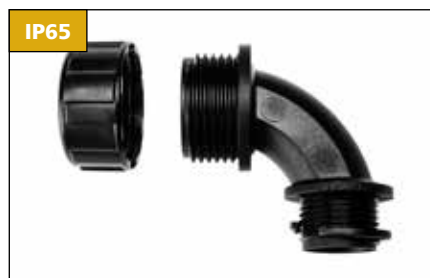
PSR-90 90° Elbow