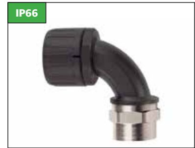
HG-90F 90° Elbow Swivel Internal Thread