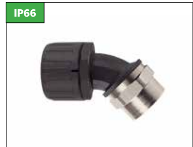
HG-45F 45° Elbow Swivel Internal Thread