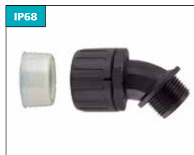
HGL-45 45° Elbow with conduit seal