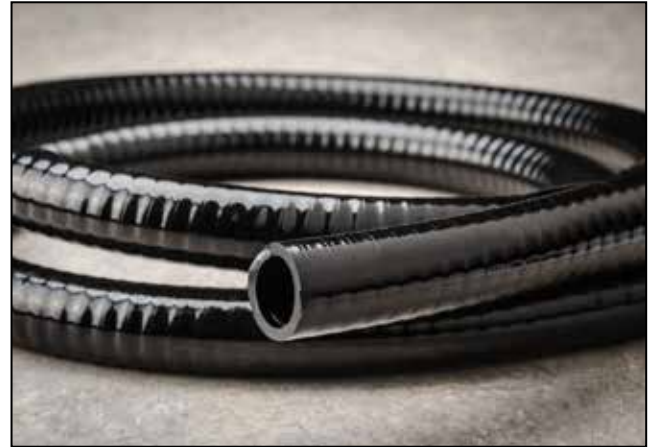
LPC Reinforced Smooth Tubing