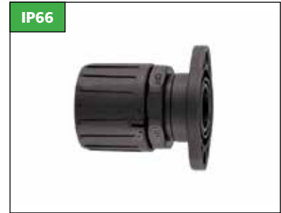
HG-SFL Straight Swivel Flange