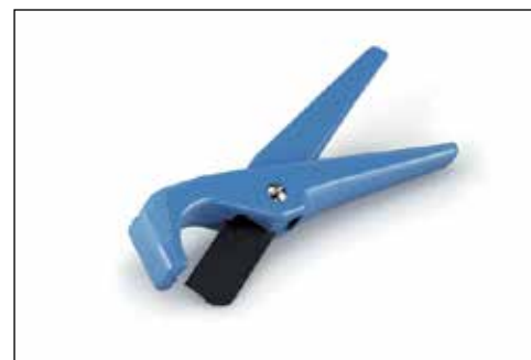
ConCutter Conduit Cutter