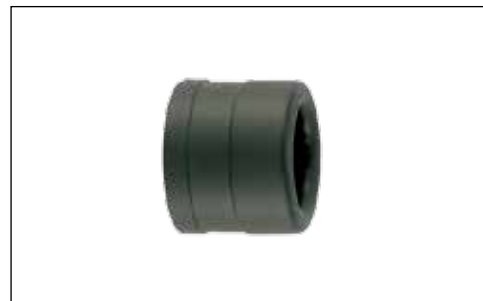
PAEC Nylon End Cap