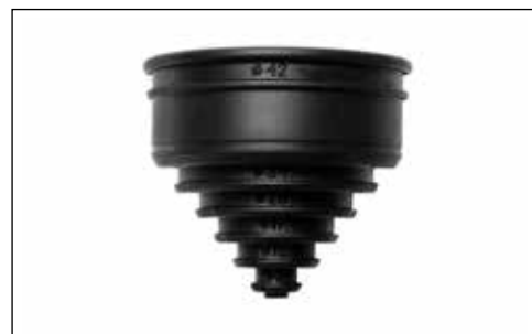
REC Rubber End Cap