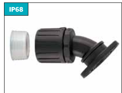
HGL-45FL 45° Elbow Swivel Flange with conduit seal