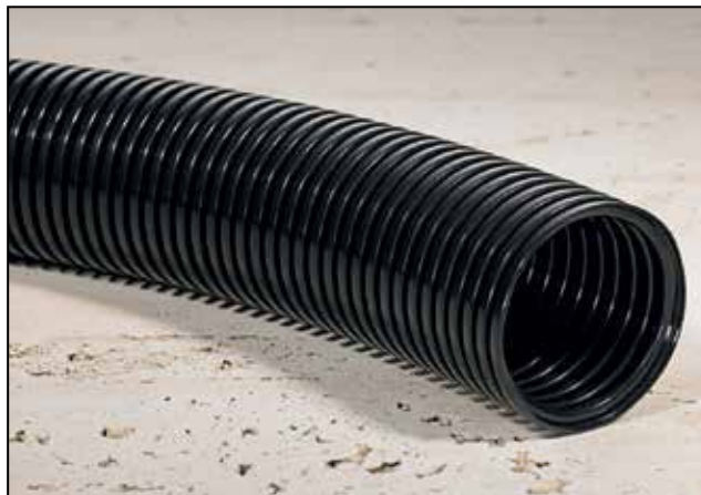
High Impact HelaGuard is ideal for robotics and industrial automation.