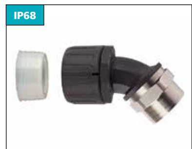
HGL-45F 45° Elbow Swivel Internal Thread with conduit seal