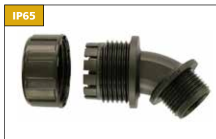
PSR-45 45° Elbow