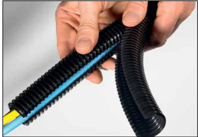
Double Slit HelaGuard allows for ease in retrofitting.