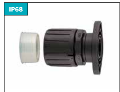
HGL-SFL Straight Swivel Flange with conduit seal