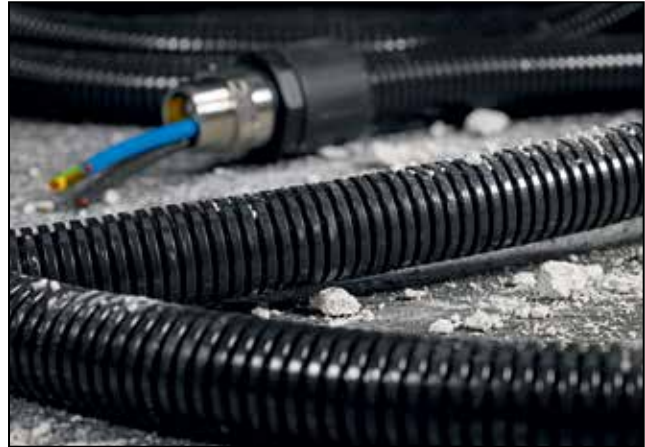
HelaGuard Standard Weight for industrial applications.