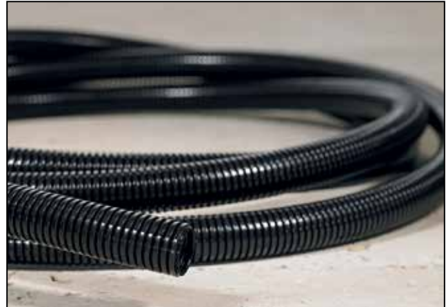
HelaGuard Lightweight is very flexible; ideal for use in moving applications.