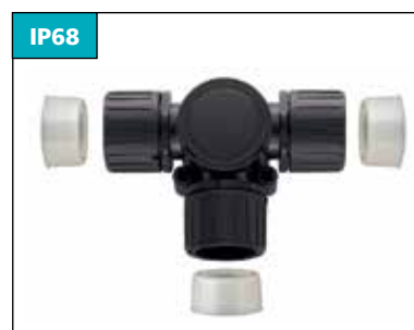
HGL-T, T-Connector with conduit seals