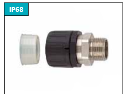
HGL-SM Straight Swivel External Thread with conduit seal