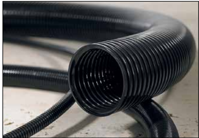
Public buildings often require Flame Retardant HelaGuard due to its high fire protection properties.