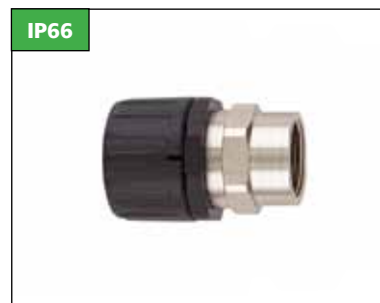
HG-SF Straight Swivel Internal Thread