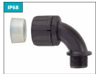
HGL-90 90° Elbow with conduit seal