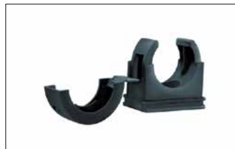
PACC Conduit Clip