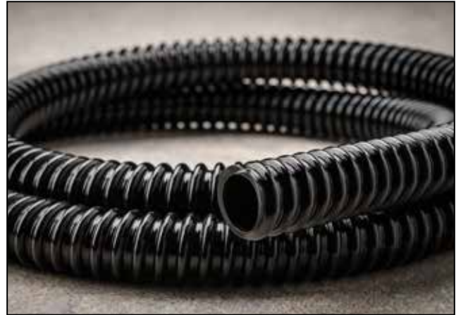
PSR Reinforced Spiral Tubing