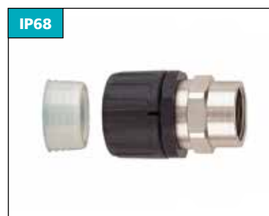
HGL-SF Straight Swivel Internal Thread with conduit seal