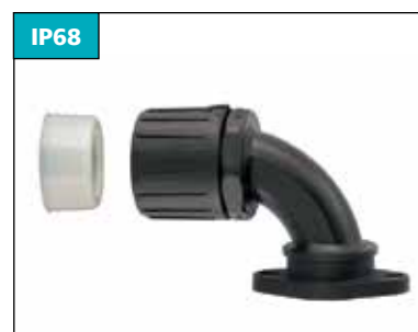
HGL-90FL 90° Elbow Swivel Flange with conduit seal