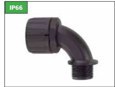
HG-90 90° Elbow