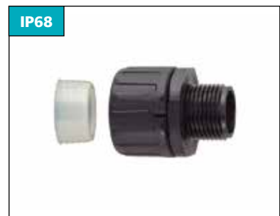
HGL-S Straight with conduit seal