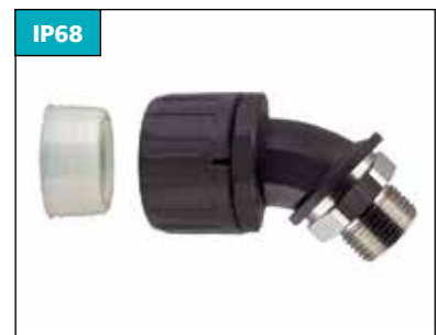
HGL-45M 45° Elbow Swivel External Thread with conduit seal