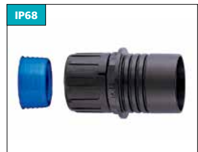
HGL-R Reducer with conduit seal