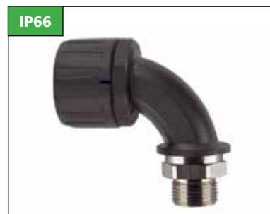
HG-90M 90° Elbow Swivel External Thread