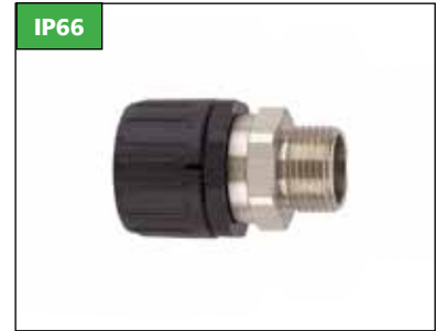
HG-SM Straight Swivel External Thread