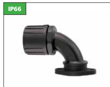
HG-90FL 90° Elbow Swivel Flange