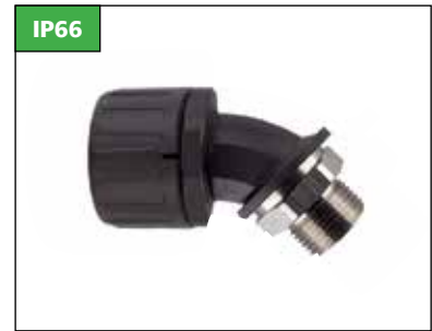
HG-45M 45° Elbow Swivel External Thread