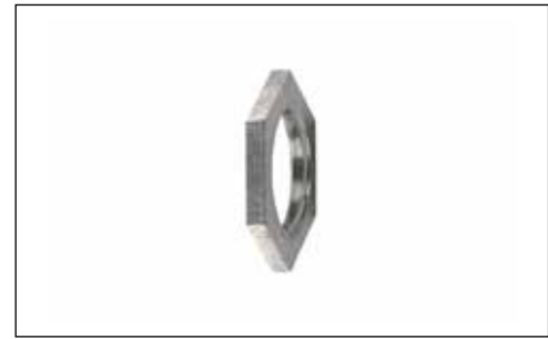
ALNPB Nickel Plated Brass Locknut