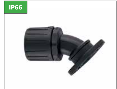
HG-45FL 45° Elbow Swivel Flange