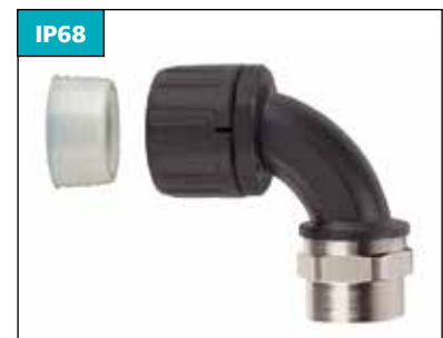
HGL-90F 90° Elbow Swivel Internal Thread with conduit seal