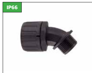
HG-45 45° Elbow