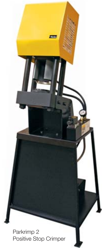
Parkrimp 2 Positive Stop Crimper

For non-critical applications or for large hose sizes where crimp couplings are not readily available, E-Z Form hose is supple enough to easily accept beaded ends secured by constant tension clamps.