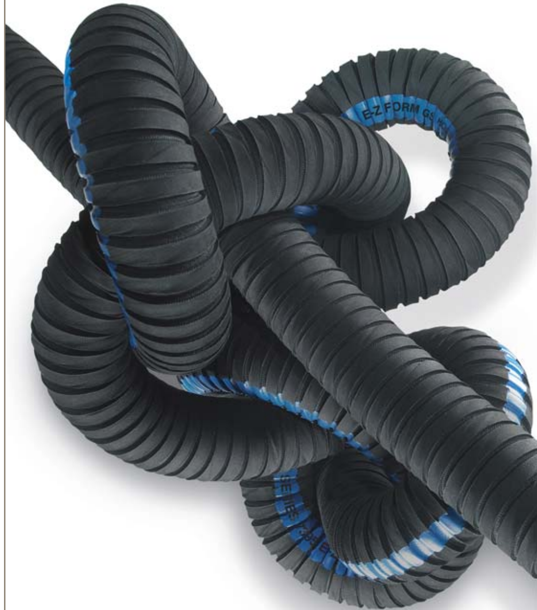
1-1/2" I.D. hose!