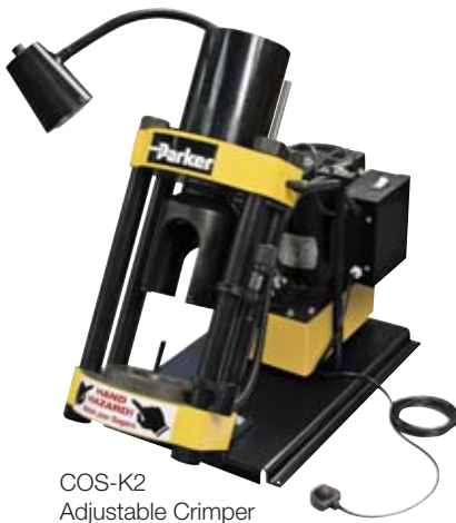
COS-K2 Adjustable Crimper